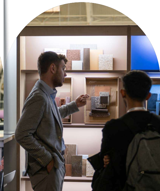
Material Bank Library