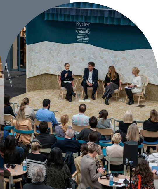
Insights Lounge by Ryder