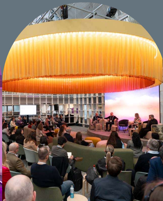
Design Talks Lounge by Gensler