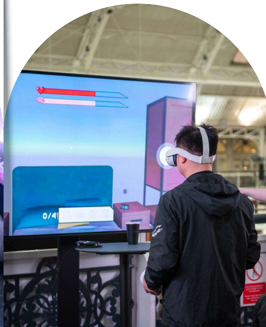
Sense of Space by Hoare Lea