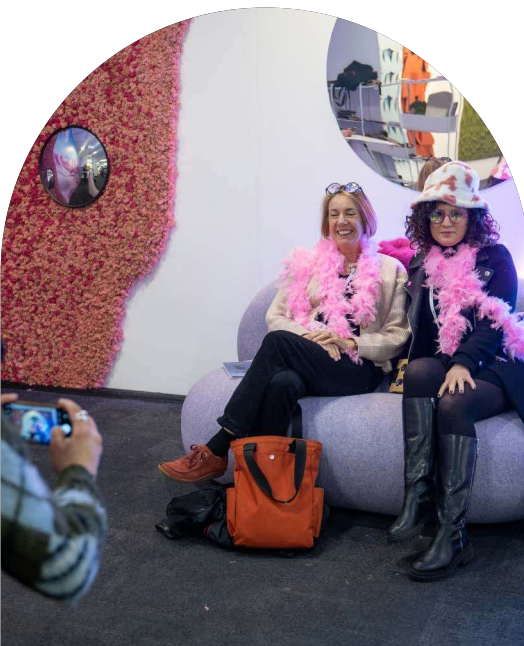
Mood Board Contest & Selfie Station by Peldon Rose